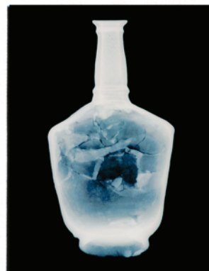
"HISTORY'S SHADOW AV9," 2010