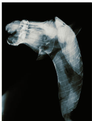
"HISTORY'S SHADOW ART," 2010